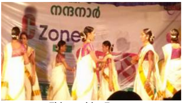
Thiruvathira Team 2nd Place (C- zone) & 3rd Place (Inter-zone)