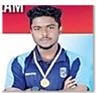
Salih bin Hamza Commerce Gold Medal